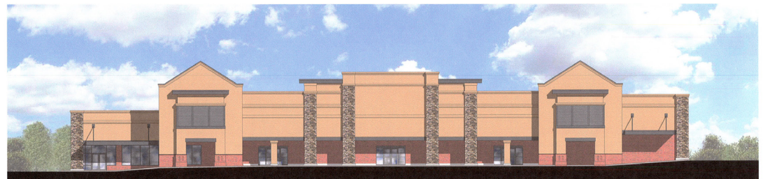
EXISTING RETAIL RENONAVATION – BUILDING A