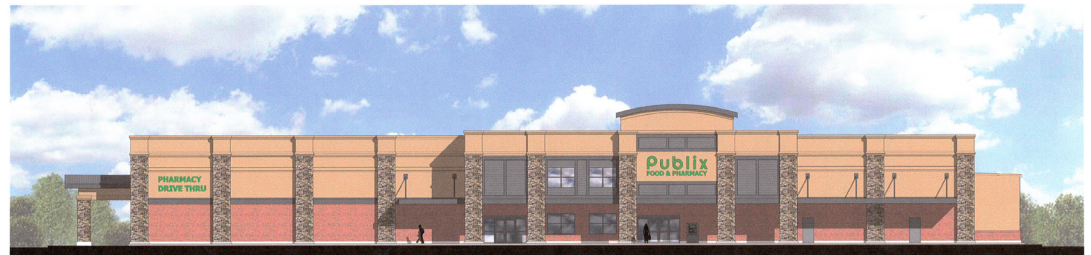
NEW PUBLIX GROCERY STORE – BUILDING D